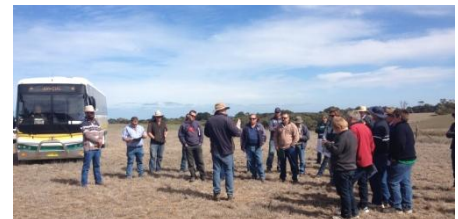
Exploring Fleurieu pasture and production systems on the recent bus trip.