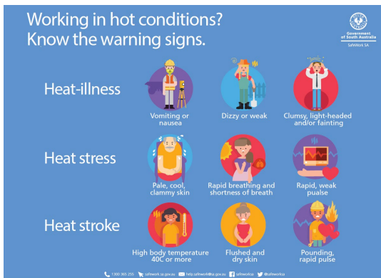
Working in heat