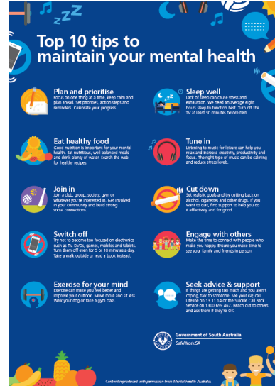
Top 10 Tips