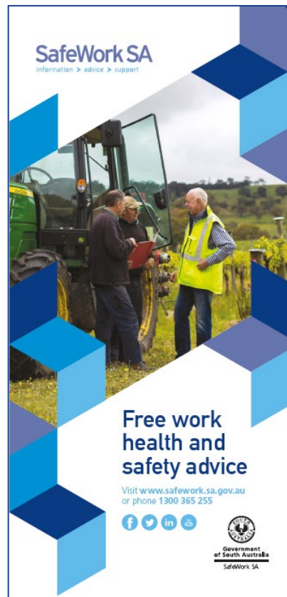
Workplace Advisory Service